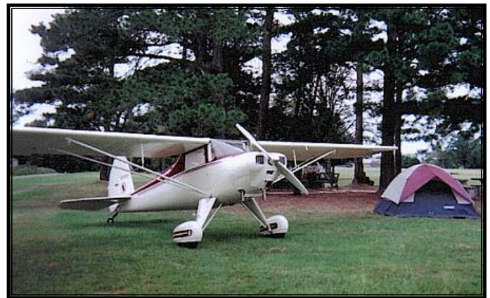
Robert Allen's Luscombe

TCM IO-550-N, 310 hp engine, all-glass panel, 185 knots max cruise.