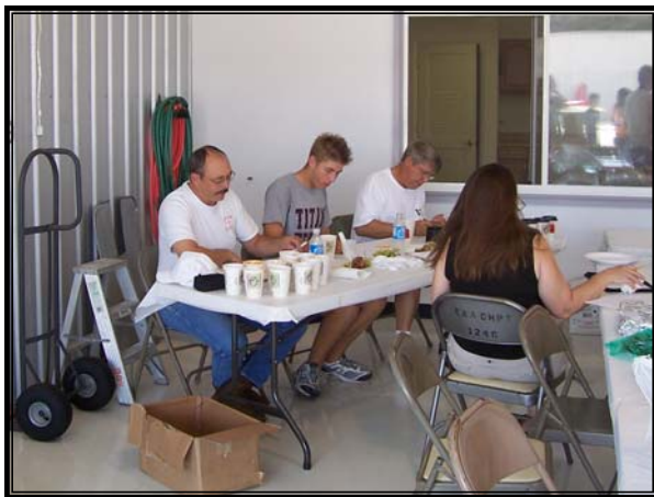
THE BEST PART! Judging ALL that marvelous chili!!!