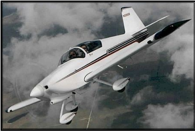
Dick Flunker's RV-6A

First flight of N326DB was in February, 1999, and the 1000 hour mark was logged on the hobbs during February 2007. The panel was originally designed for day/night VFR, but after enjoying the great cross country capabilities and experiencing several unplanned overnight stays, the panel and pilot were upgraded to be IFR capable. The panel upgrade was done first, then the pilot upgrade. All IFR training and the check-ride was done in N326DB. With the slider canopy, the panel upgrade involved a lot of on-your-back and in-your-face installation activity. As you can see in the photos, the 1999 panel and 2006 panel look considerably different, and it seems there are always additions or changes being considered.