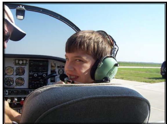
The Return Grin Says It All!