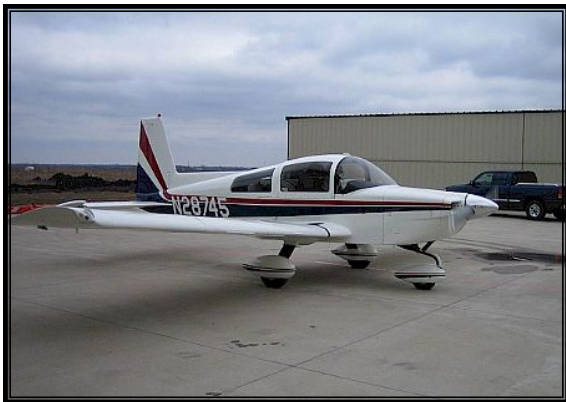
Jeff Ferraro's Grumman American AA-5B

On September 18, 2004, my Sonex took to the air for the first time. It's a taildragger with a Jabiru 2200, Aero-carb, and dual sticks. It's built almost exactly to the plans except for a few minor things like an added flap notch. It came in at 609 lbs. empty. I do have a few extras on the panel like a transponder and a Garmin 195 mounted on the panel.