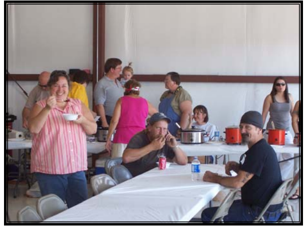
Only 14 more entries to sample!