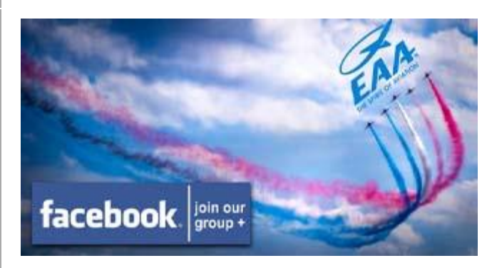
We're on Facebook! EAA Chapter 1246 Join Today!

What is EAA? The Experimental Aircraft Association is an organization that promotes all forms of recreational aviation. EAA Chapter 1246 - Building Lasting Relationships and Making New Friends! Like the Television show, Cheers - You want to go were everybody knows your name. Join our Chapter!