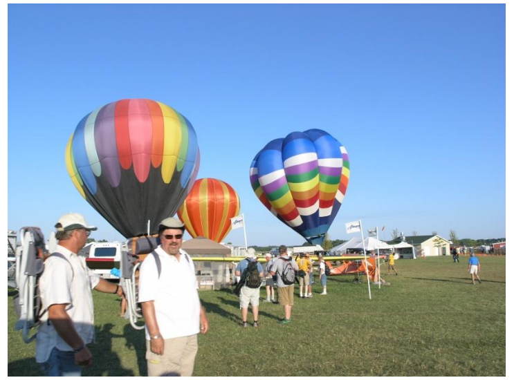
Click Here for more pictures!